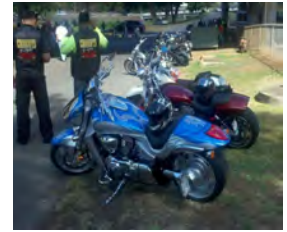
We not only blessed the children but also ministered to the bikers who looked on as we prayed.

March 27—Five COL and 1 guest attended the Donnie Smith Bike Show and was able to pray for one person’s healing. There were a lot of nice bikes at the show and swap meet. There were a number of hard core clubs on site, including Hell’s Angels (from as far away as the Illinois Chapter).