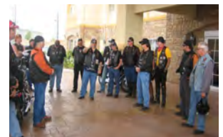
Texas Tour 2009 Familiar faces Chariots of Light

“Our neighbor was diagnosed with prostate cancer. No tumors or cancer in her body! Today she is cancer free. All praise be to God!”