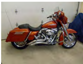
We are looking forward to the upcoming riding season. I got a new bike in December. —Street Glide 103