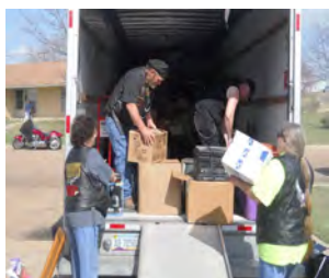
We had a great time of planting seeds while we helped a couple move that we've been witnessing to for quite some time.

While being a part of the COL Outreach, I was reminded of God's mercy that was given to me when my life was in despair and I was searching for some hope.