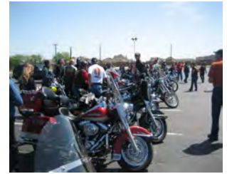
Chariots of Light at a 2008 COL Texas meeting. Great to still see familiar faces!

March 24 - We had 1 salvation while teaching on the blood covenant. It really helped a lot of people understand who's got their back in Christ Jesus. We also counseled two people on the authority of the believer and the power of prayer.