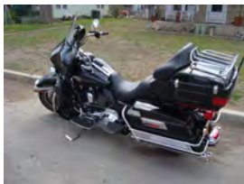
The picture tells the story ... Ultra Classic 2010 ... Blessing of God that will see its first outreach in April !!!