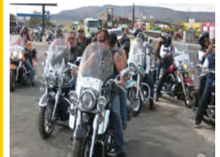
A great time in the Lord with like-minded believers!

“The April COL Outreach at the Laughlin River Run in Nevada will be a supernatural event, over the top and long remembered.”